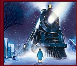
THE POLAR EXPRESS